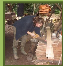
Helping in construction

At other times we were lucky to have the whole house full, and got many things done. It is great to see how everyone helps with everything. You don't need to have special expertise, just willingness to learn and do new things.