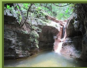
A beautiful place in the middle of the jungle; the '2nd waterfall'

With the donations we have been able to build the house-work shed in Bello Horizonte and finance the new boat, as unfortunately the old one got stolen. Thank you all!