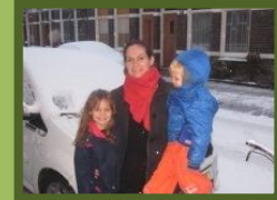
Snow in Holland