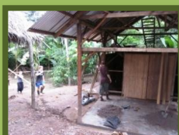
Workshed in Bello Horizonte

We are still working on it... We also build an inside front cage to separate animals, for introduction of new ones and/or for observation. This year we received another donation of the DGHT-Stadtgruppe, so we can continue with more improvements and other facilities for receiving reptiles.