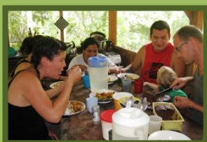
Lunch at Esperanza Verde

We are currently trying to get a more permanent visa so we can start the process of applying for the license. With all the current construction, and future construction, we will be able to start the application.