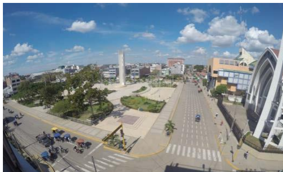
Plaza de Armas in Pucallpa