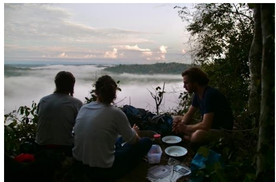
Sunrise at "El Mirador"

A volunteer visa does not exist in Peru, if you are asked about the purpose of your travel state 'tourism' . You normally get a 90-day visitor visa when entering Peru. If you know you are staying longer than 90 days, make sure to ask for the maximum stay of 180 days before they stamp your passport. You can also extend your 90-day visa at the Immigration Office in Pucallpa or Lima or get a new 90-day visa by leaving the country and re-entering after a day. Officially you can only receive 180 days per calendar year.